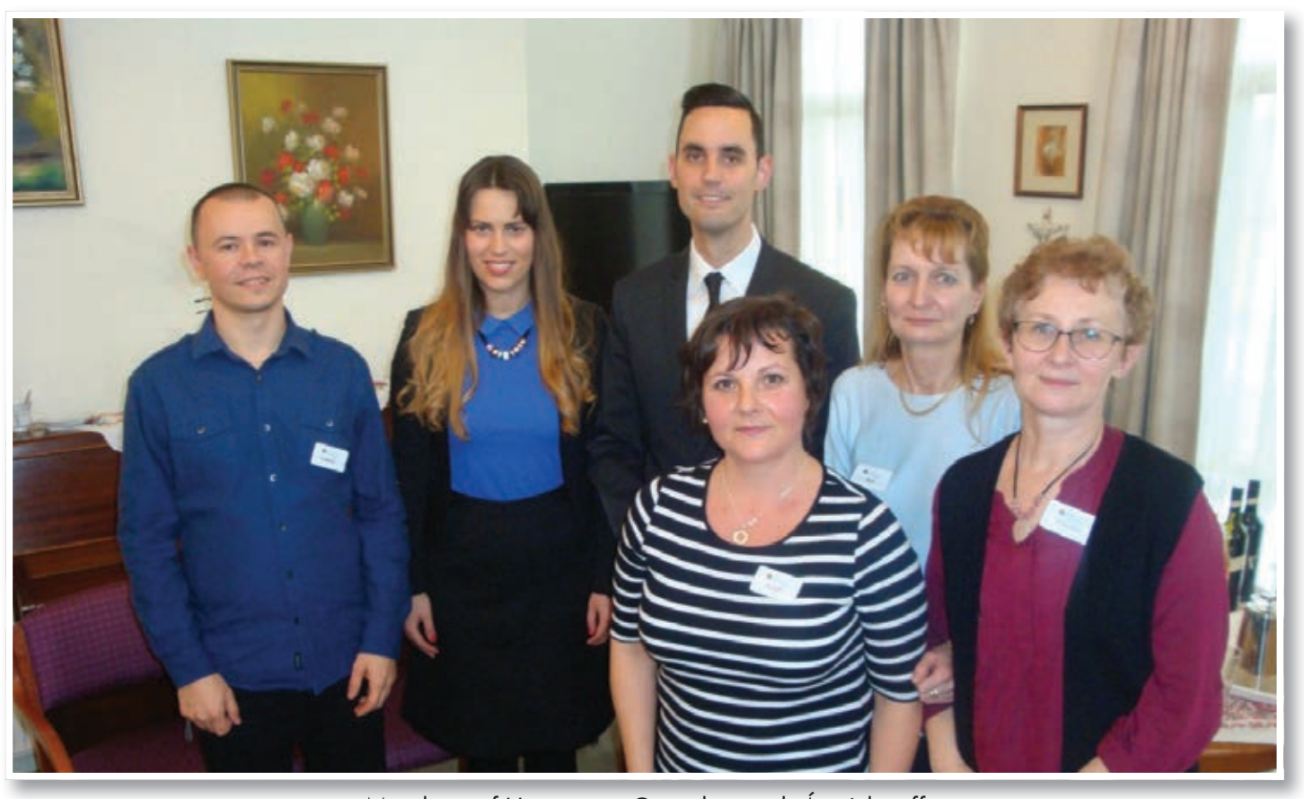
Members of Hungarian Consulate with Árpád staff